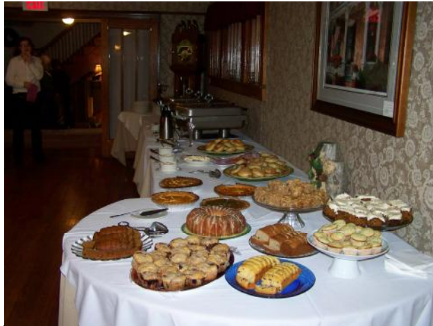
The Home-baked Section: The end of the buffet line at the 12th Annual Meeting of the Helpers Fund had the home-baked goods which included bagels, quiches, and eight different baked sweets. The hot stuff was at the head of the line (background).

Money donated specifically for scholarship purposes, and the 50/50 Raffle are presently the only means of raising scholarship money. The continued on page 3